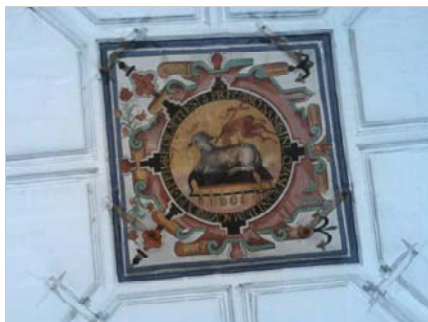
Illustration 4: Agnus Dei - The Lamb of God on the Book with Seven Seals. Iglesia de la Anunciación, Sevilla, España, 1616 45

In the Western biblical tradition, the white lamb, Agnus Dei , is a common element in the liturgy of the mass, a metaphor for the Eucharist, and as such it has also been widely used in iconography (see Illustrations 4 and 5). 44