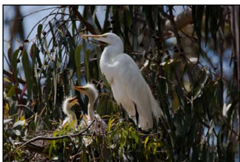
Illustration 2: Great Egret (Ardea Alba 2009)

Holguín’s translation of the bird is an accurate description of what he must have seen (1), the term “huaccarpaña vña” apparently only referred to the white baby llama as sacrificial animal (2) and was probably elicited from his consultants. We do not know whether this kind of sacrifice was still being made at the beginning of the 17th century, but the chronicler Cieza de León still witnessed it in the 1550s. 43 Despite the uncertain etymology the 'sacred' character of this animal moved González Holguín to suggest it as equivalent translation for Agnus Dei.