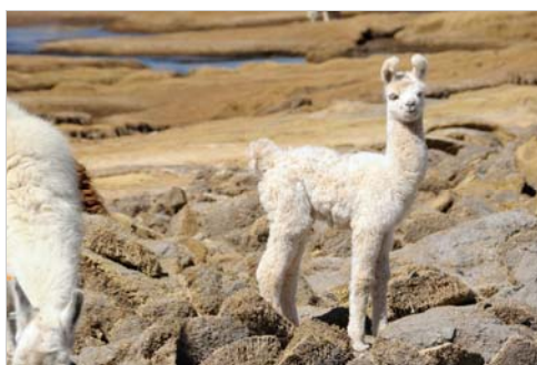
Illustration 3: Baby Llama ([2008])

verb “huacca-” means ‘to comb the wool by hand’, ibid. ). It is possible that this is connected to the custom to use (still at present) the fine wool from the llama's neck to weave ceremonial garments (Lindsey Crickmay, personal communication, 17 January 2017). In Quechua pañã means ‘right hand, right-hand side’ (González Holguín 1608, Qu-Sp: 274, 1989: 277), but it is not an Aymara word (Bertonio [1612] 1984, Sp-Ay: 207). In Quechua the additive meaning of the elements as a word-for-word translation (*white heron – right-hand side) does not make much sense, and it is possible that the word as a whole (and its meaning in religious ritual) is a loan from another language (such as Puquina), possibly adapted through a folk-etymology.